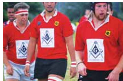
The 4th grade jerseys showing Lodge Chelmsford 261 sponsorship

valuing the bond that develops amongst a group of men from all walks of life joined in a common interest, sharing the responsibilities and rewards of teamwork and common goals. Although the discipline and preparation required within Freemasonry is more mental than physical, each individual, whether a rugby team member or masonic lodge member, can benefit from the support and encouragement of the group and contribute to the combined achievement of the team and the lodge.